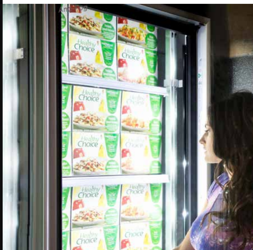
Enhanced Efficiency and Visibility

The Eliminaator Renu is Anthony's energy-efficient cooler and freezer application that eliminates heated doors, saving energy and expense. The stylish Eliminaator Renu doors offer 25% more visibility than previous models and provide optional trim rail designs that deliver a distinct refinement and contemporary aesthetic.