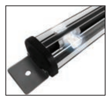
Optimax Pro 24 LED