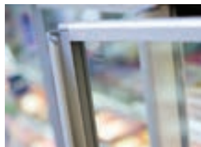
Full Length Handle