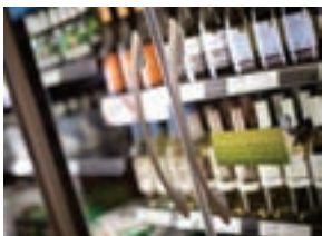
Vista Arch Handle