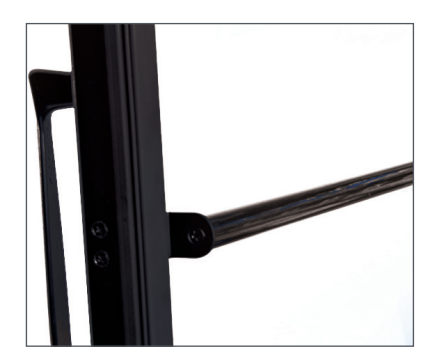
Round Push Bar