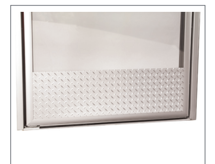
Diamond Pattern Kick Plate