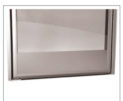
Stainless Steel Kick Plate