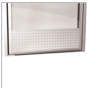
Diamond Pattern Kick Plate