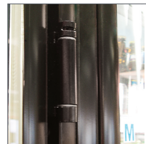
Heavy Duty Hinging