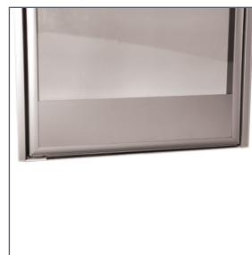
Stainless Steel Kick Plate