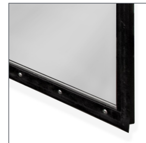
Adjustable Wipers Seals