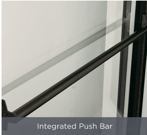
Integrated Push Bar

Kodiak's Pass-Thru cooler doors are easy to install and engineered for high traffic and long life. The robust, durable design can withstand years of use and tough handling by customers. From convenience stores to large retailers, Kodiak doors are the superior choice for your store operations.