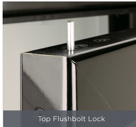
Top Flushbolt Lock