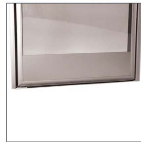
Stainless Steel Kick Plate