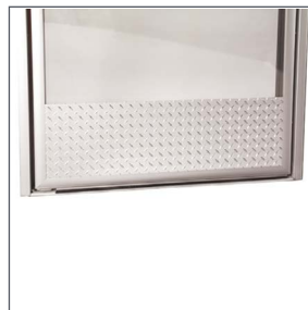
Diamond Pattern Kick Plate