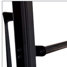
Round Push Bar