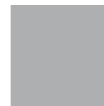
Silver Formica (101 Series Only)