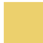
Gold Formica (101 Series Only)