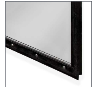
Adjustable Wipers Seals