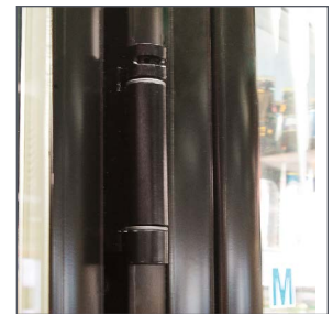
Heavy Duty Hinging