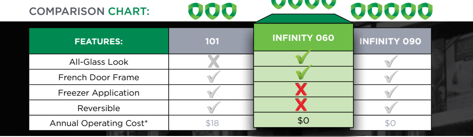
*Cooler Application, $.12 kWh Utility Rate, one 30" x 75" Door Only