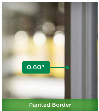
Nominal size is 0.60", actual size is 0.62"

The slimmer addition to the Infinity® line, the Infinity 060 is best complemented with an Infinity 090 freezer line up and featured in a contemporary store design.