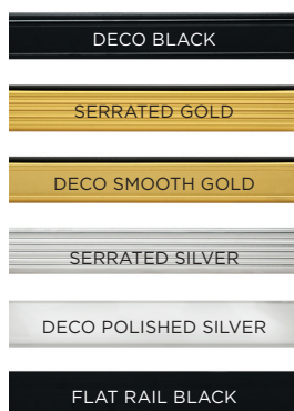
Standard Door Rail Options