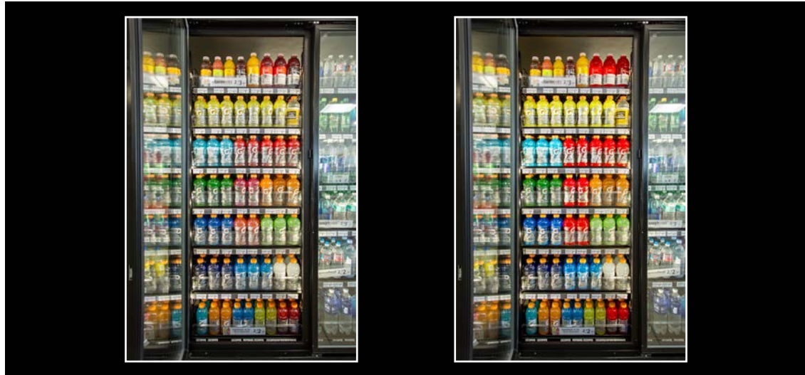
OPTIMAX RADIANT OP45

Energy efficiency does not have to mean poor visibility. With Anthony's Optimax Radiant Series lights, merchandise color rendering (specifically red colors) is enhanced (above) while brightness (below) is consistent and uniform.